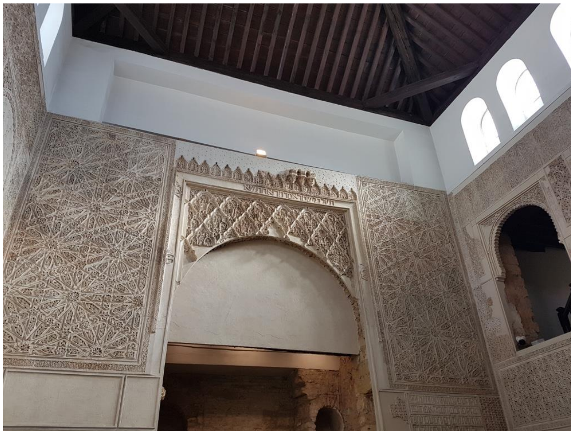
Fig. 5. Yesería in the Synagogue in Cordoba