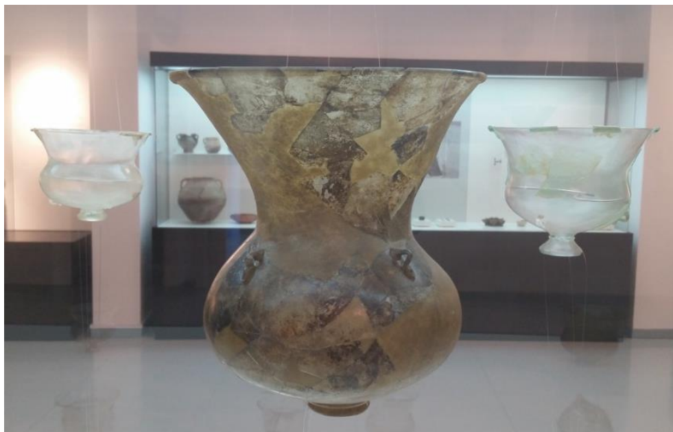
Fig. 4. Glass lamps from the synagogue in Lorca. Exhibition at the Archaeological Museum of Lorca from 2016