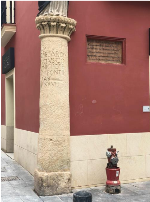
Fig. 1. A replica of columna miliaria on Corredera Street in Lorca