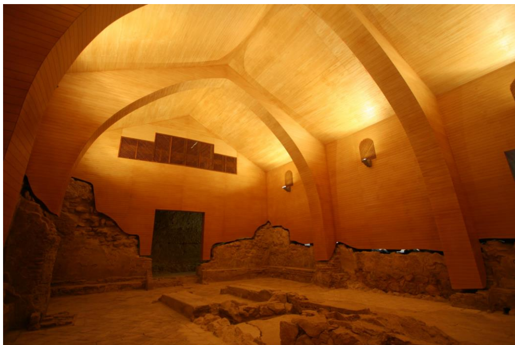
Fig. 6. Reconstruction of the interior of the synagogue in Lorca