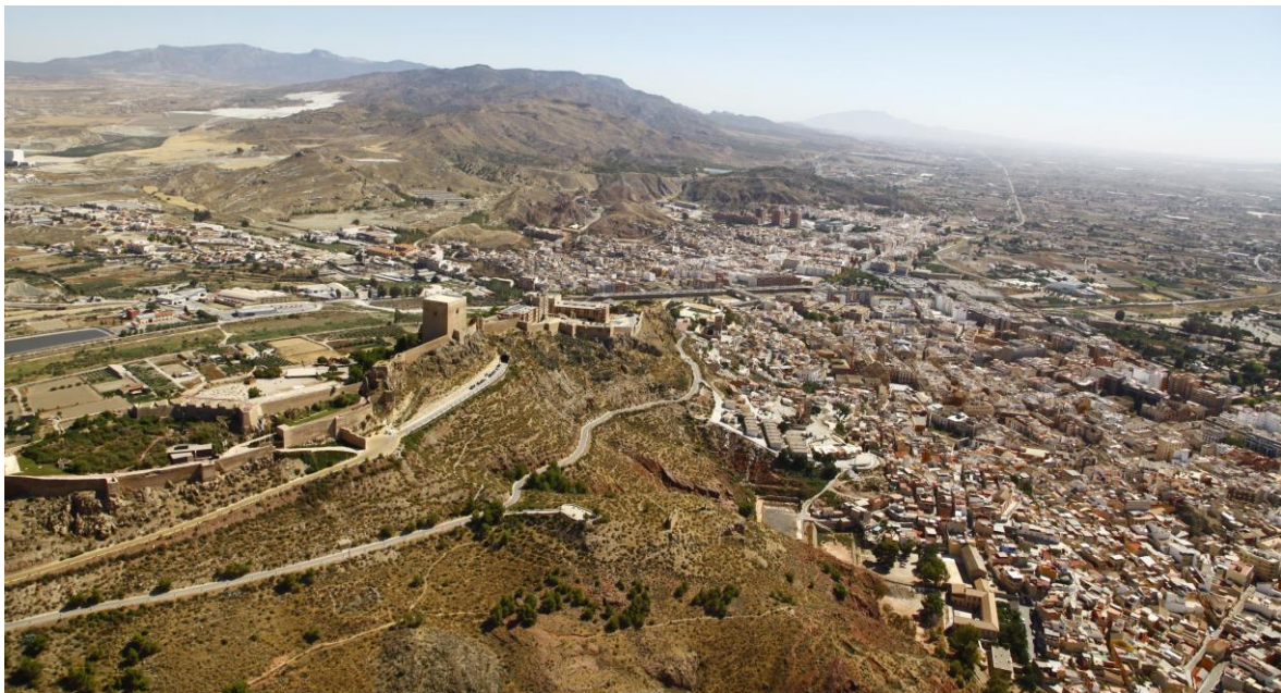
Fig. 2. An aerial photograph of the castle in Lorca taken during research in 2013